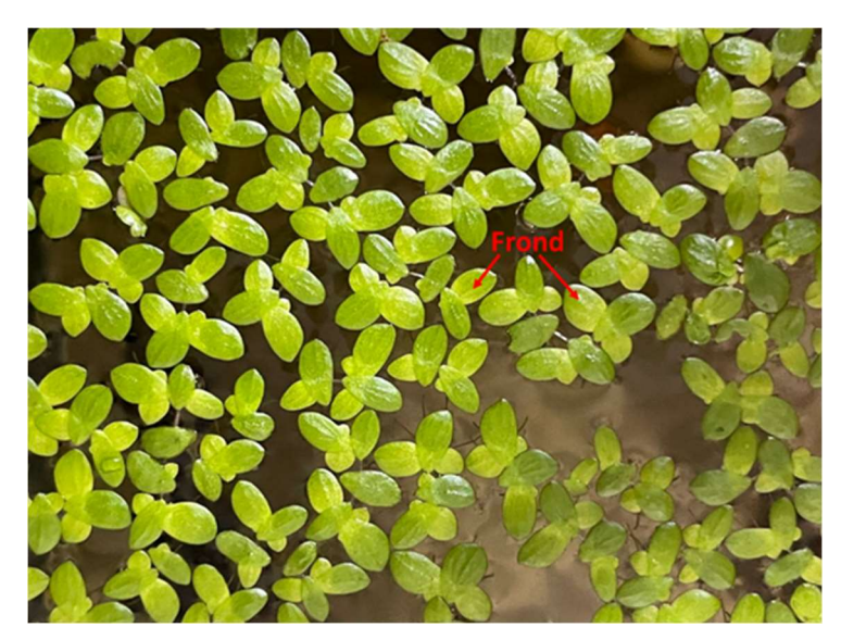
Figure 1. Duckweed, the floating aquatic plants.

region in terms of production as well as utilization of duckweed for human and animal consumption. The utilization of duckweed has likewise increased substantially in Europe and America due to the increasing growth of wastewater treatment. Owing to its several applications (as discussed in the following sections), the duckweed market shall open the doors to different opportunities for development over the tenure of analysis, from 2020 to 2030.